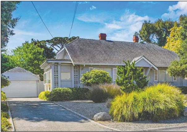
835 Bayview Avenue, Pacific Grove — $1,610,000