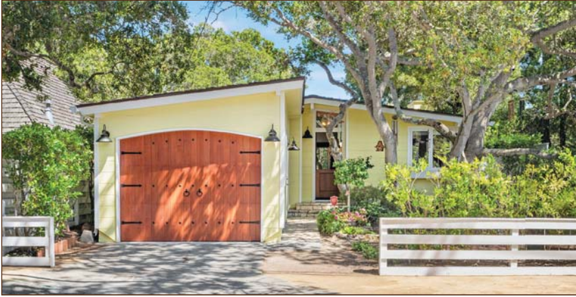
NE Corner of San Carlos & 13th, Carmel-by-the-Sea 3 Beds, 2 Baths ♦ 1,260 Sq. Ft. ♦ $2,895,000 ♦ NECSanCarlos13th.com

MID-CENTURY MODERN CARMEL-BY-THE-SEA HOME