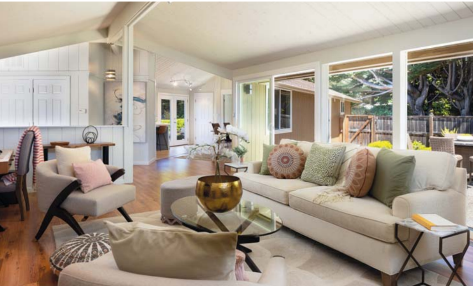
Carmel ■ 3 beds, 2.5 baths ■ $1,895,000 ■ www.26022CarmelKnolls.com