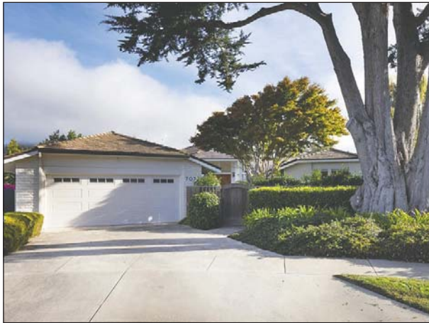
835 Bayview Avenue, Pacific Grove — $1,610,000