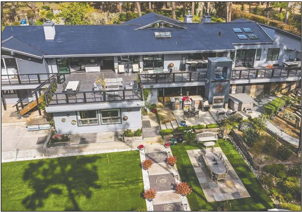
1276 Viscaino Road, Pebble Beach — $4,850,000

Shea Homes LP to Alexandra and Thomas Carter APN: 031-054-020