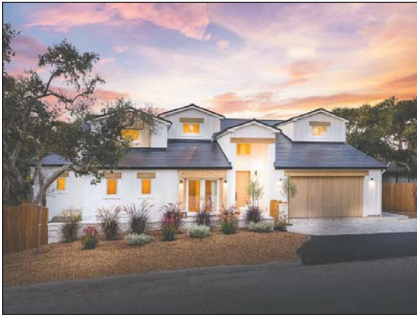
2884 Lasauen Road, Pebble Beach — $4,175,000

24520 Outlook Drive unit 19 — $1,544,500 Stacey Carr to Tyson Schmidt APN: 015-551-019