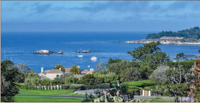
3365 17 Mile Drive, Pebble Beach 5 Beds, 6 Baths ♦ 4,082 Sq. Ft. ♦ $12,900,000 ♦ 3365SeventeenMilePB.com

OCEAN, STILLWATER COVE & GOLF COURSE VIEWS FROM EVERY ROOM