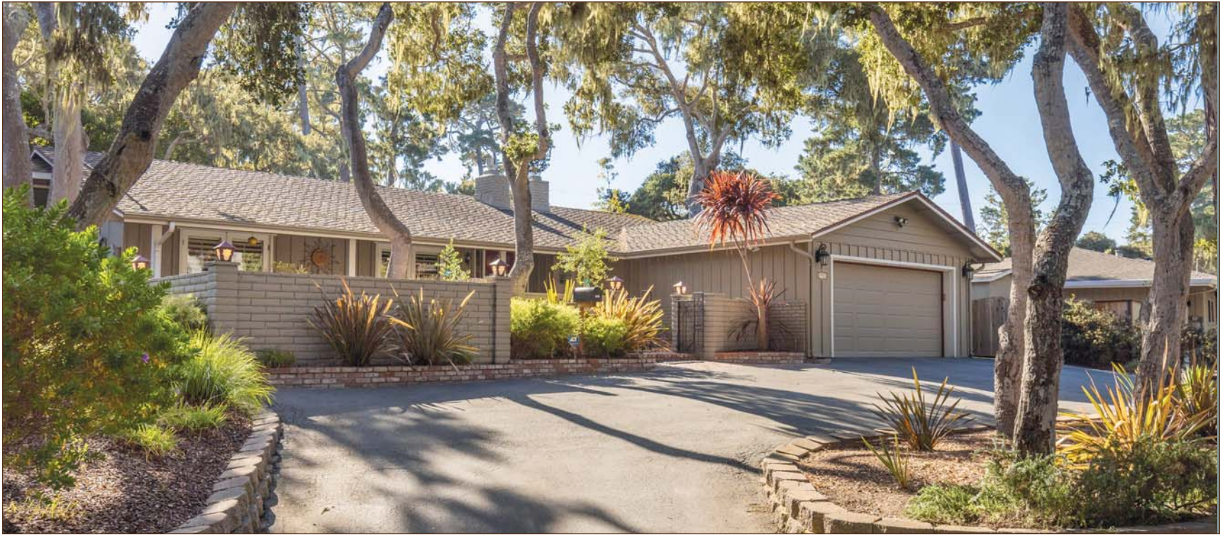
2903 Colton Road, Pebble Beach 3 Beds, 2 Baths ♦ 2,074 Sq. Ft. ♦ $2,195,000 ♦ 2903ColtonRoad.com

CHARMING & CONVENIENT PEBBLE BEACH HOME IN COUNTRY CLUB NEIGHBORHOOD