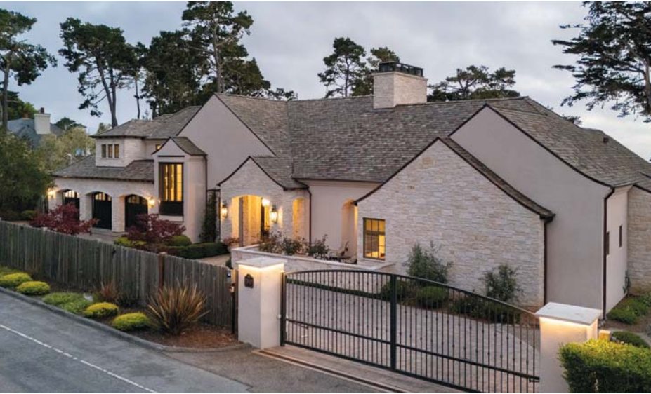
Pebble Beach ■ 4 beds, 3.5 baths ■ $9,450,000 ■ www.ViscainoRoad.com