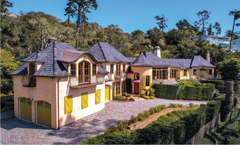
Pebble Beach ■ 5 beds, 6 baths ■ $12,900,000 ■ www.3365SeventeenMilePB.com