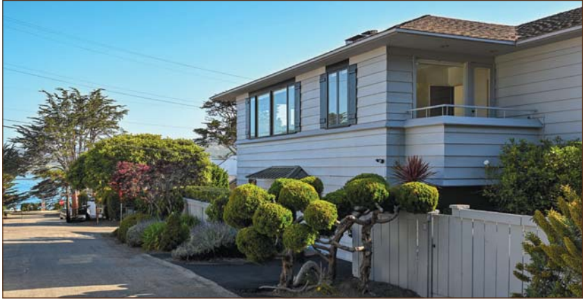
2416 Bay View Avenue, Carmel 3 Beds, 4.5 Baths ♦ 2,566 Sq. Ft. ♦ $6,950,000 ♦ 2416BayViewAvenue.com

“POINT OF VIEW” CARMEL HOME WITH BEACH & FAIRWAY VIEWS