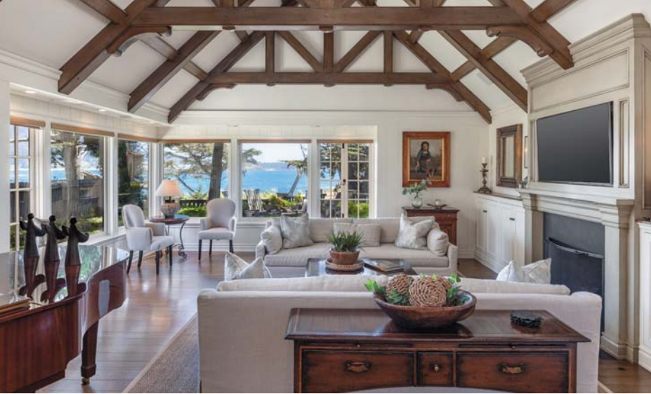
Carmel ■ 4 beds, 3 baths ■ $15,000,000 ■ www.ScenicOnThePoint.com