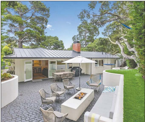
25990 Junipero Street, Carmel — $3,150,000

3972 Hayden Way unit B — $380,000 The Sea Haven LLC to Roxana Hosseini APN: 031-294-002 3346 Tracy Court — $998,000 Visionary Development LLC the Hemant and Sandhya Patel APN: 033-272-009 3034 Arroyo Drive — $1,659,000 The Sea Haven LLC to Anthony Roaque APN: 031-311-031