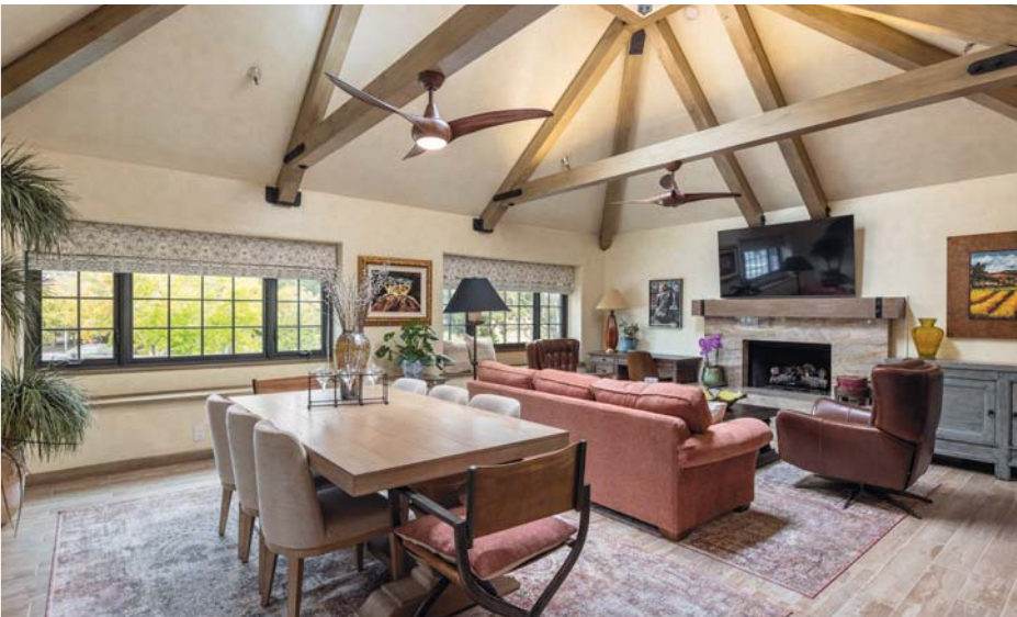
Carmel-by-the-Sea ■ 2 beds, 2.5 baths ■ $2,495,000 ■ www.SWCJunipero4th.com