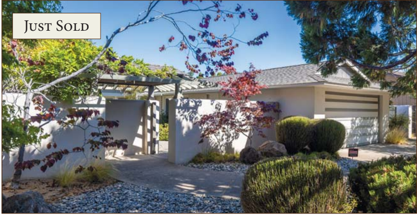
7067 Valley Greens Circle, Carmel 3 Beds, 2 Baths ♦ 2,178 Sq. Ft. ♦ SP: $2,600,000 ♦ Represented Seller

PALM SPRINGS CHIC STYLE, SINGLE-LEVEL HOME IN QUAIL LODGE