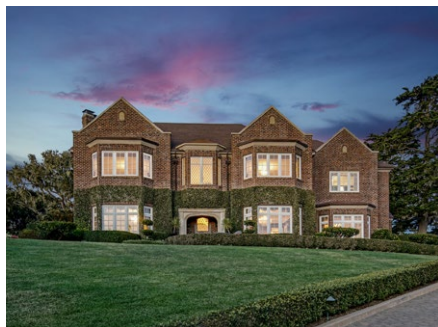
PEBBLE BEACH PadreManor.com

Just a short stroll from downtown Carmel, this charming Carmel Cottage provides the perfect getaway in our village by the sea.