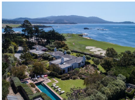
PEBBLE BEACH StayAt18.com

Located on the legendary 18th hole of the famed Pebble Beach Golf Course is this classic French Country, 6-bedroom home.