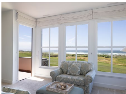
PEBBLE BEACH SpanishBayGetaway.com

Set just 3 blocks from The Pebble Beach Lodge & Resort, shopping, and iconic golf courses, this significant estate enjoys ocean views.