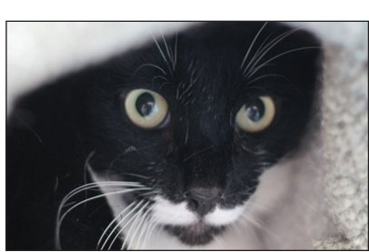
When SPCA workers arrived at a Seaside home to investigate animal abuse, they found a horror scene (left). Some of the rescued cats had hopeless looks in their eyes (above).